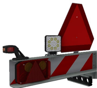
LED WORK LIGHTS