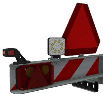
LED WORK LIGHTS